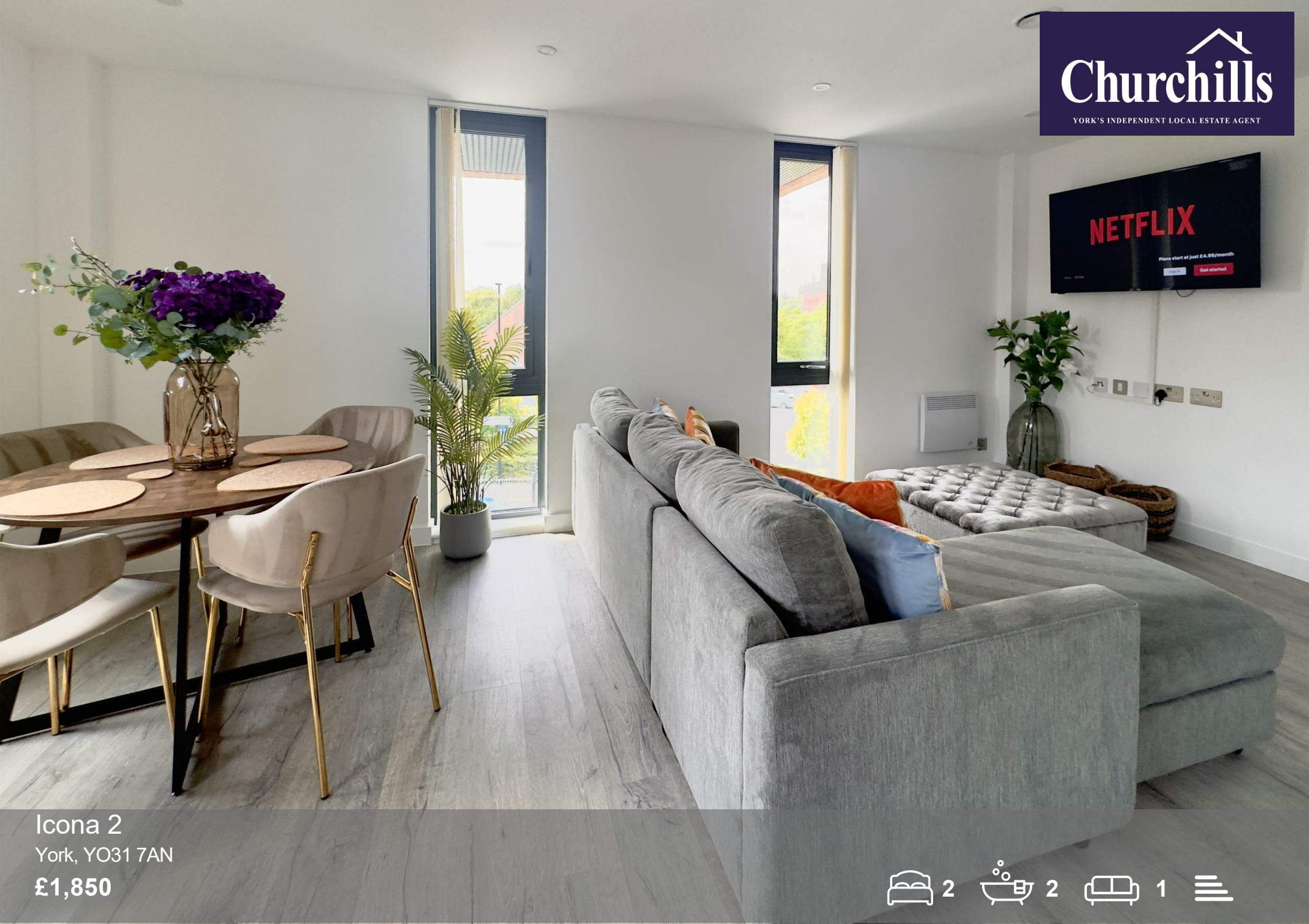
Icona 2 York, YO31 7AN £1,850